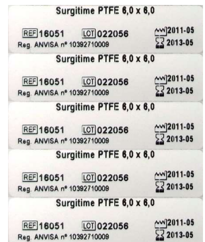
Identification Labels: Ensure total product traceability

Final package of Bio Health: Box of cardboard