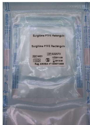
Primary and Secondary packaging: Thermal sealant envelope and identification label